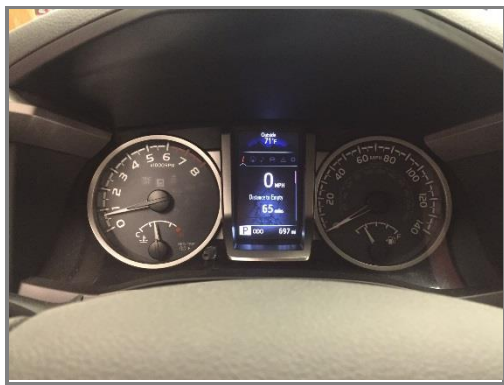
No MIL Illuminated

Considering the fact that a capable scan tool is the only way to identify some DTCs, Toyota requires that repairers perform a “Health Check” diagnostic scan if a vehicle has sustained damage as a result of a collision that may affect electrical systems. Additionally, Toyota strongly recommends that repairers perform a “Health Check” diagnostic scan before and after every repair to identify and document DTCs. If DTCs are identified pre-repair, then they can be considered to create a complete vehicle damage analysis report. If DTCs are identified post-repair, then they can be diagnosed and addressed before returning a vehicle to the customer.